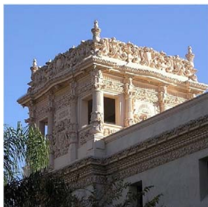
Balboa Park Architecture