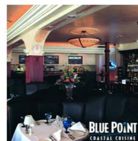
BLUE POINT COASTAL CUISINE

Point is the perfect time to come and celebrate the legendary oyster. Contact your Concierge for reservations for the Oysterfest 2007 celebration.