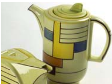
Spicing Up Pottery by Eva Zeisel