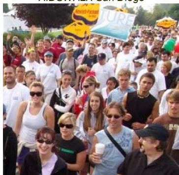
AIDSWALK San Diego