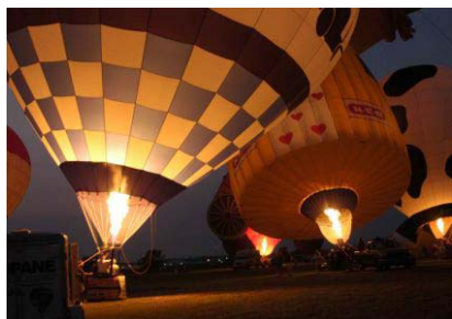
Fiery Balloon Glow After Sundown