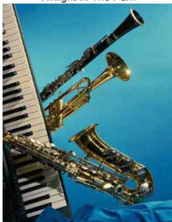
Twilight In The Park