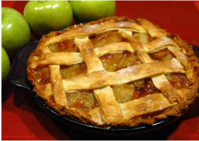
Autumn means Apple Pie