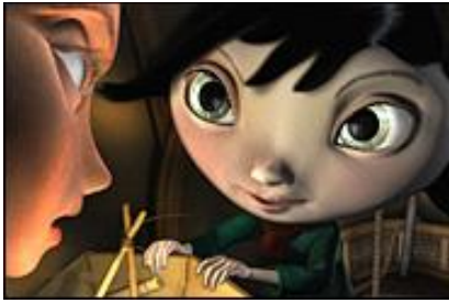
San Diego Children's Film Festival

Produced by The Children's Film Festival Company, the 5th annual San Diego International Children's Film Festival has just the ticket for family fun. This year's fest will showcase more than 100 animated, live-action and documentary films made for children from around the world, clustered for different age groups (ages 1-17) and their families on August 9 & 10 at Museum of Photographic Arts and August 23 at the San Diego Central Library downtown. The goal of the festival is to introduce children to different cultures and creative film-making techniques. One-hour programs are designed at each respective location and filmmakers will attend to showcase their works and answer questions. This event is free for all ages. Contact your Concierge for the schedule and show times.