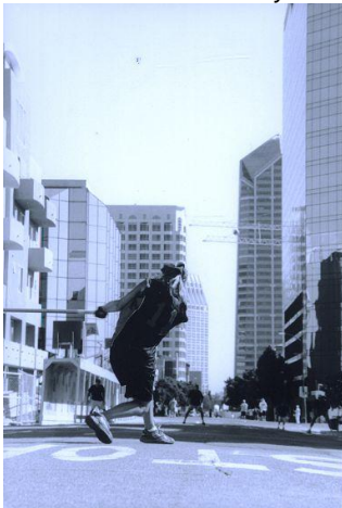
Stick Ball in Little Italy

On August 30 to September 1 come and watch the streets of Little Italy come alive with the good ol' American (East Coast) past-time: STICKBALL. Every year local teams come together to play for the right to call themselves the king of the block. The champions! Stickball emulates baseball, but is played in the street - in this case, on Colombia Street, between Ash and Cedar. Buildings, curbs, parking meters, signs and balconies are all playable in fair territory. Bronx rules are applied; no gloves allowed, the batter pitches to himself, and he gets one swing of the stick to hit the rubber ball. People play to either recapture their youth, or simply to take over the streets and have fun. Come and enjoy the taunting, heckling and great fun on Saturday and Sunday from 8 am to 6 pm on Columbia Street, between Beech and Cedar Streets, and State Street, between Ash and Beech Streets. This year's tournament is an invitational and teams from New York and Puerto Rico will attend. It's sure to be an exhilarating game.