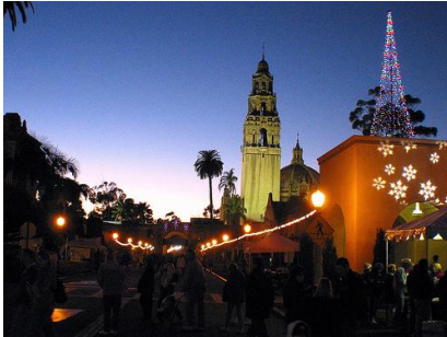
Holiday Lights at the California Tower