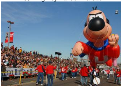
2007 Big Bay Balloon Parade