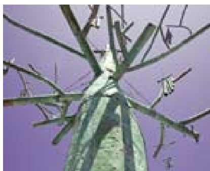
Faux Foliage at the Embarcadero