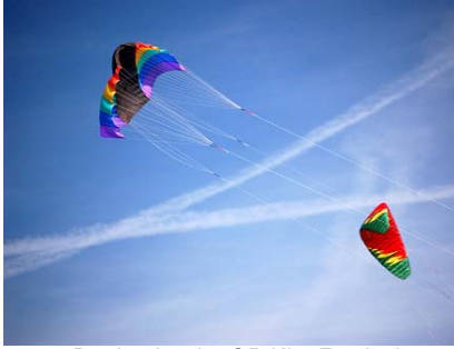
Don't miss the OB Kite Festival

Your Pinnacle Concierge Team really helped out in February!