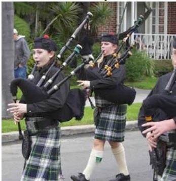
St. Patrick's Day Parade