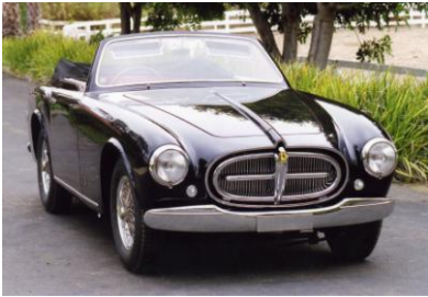
Ferrari Exhibit at the San Diego Automotive Museum Oct 1 – Nov 15