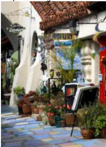
Spanish Village in Balboa Park